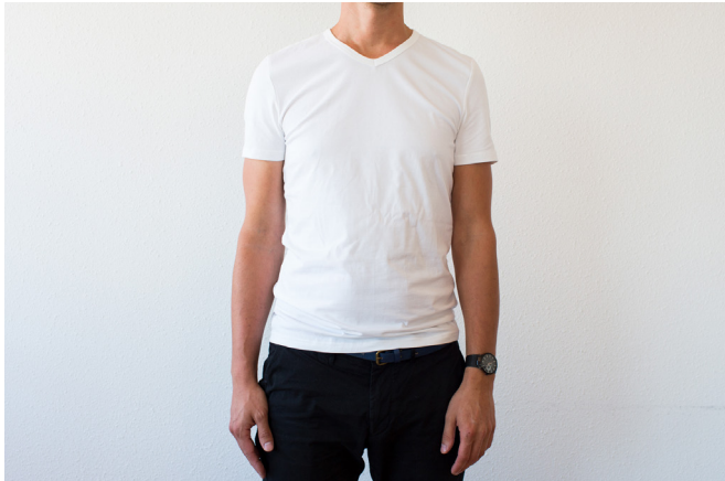
A. Place the patient in front of a plain background.