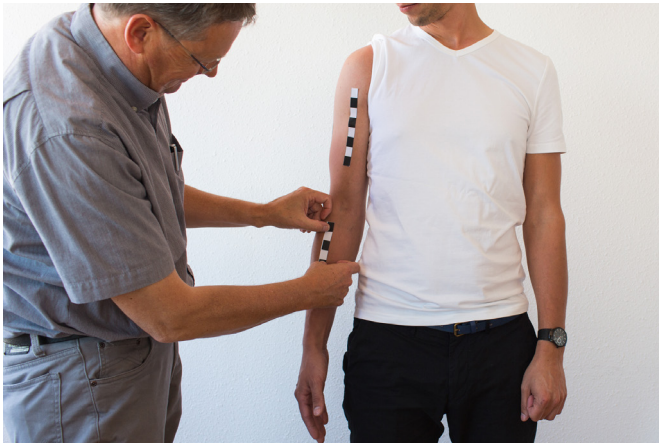
G. Stick the third measurement label frontal on the forearm.