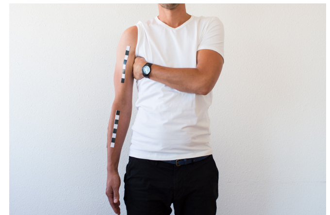
I. Hold a hand under the armpit, as high as possible, so the arm does not touch the trunk, and the top of the arm is visible.