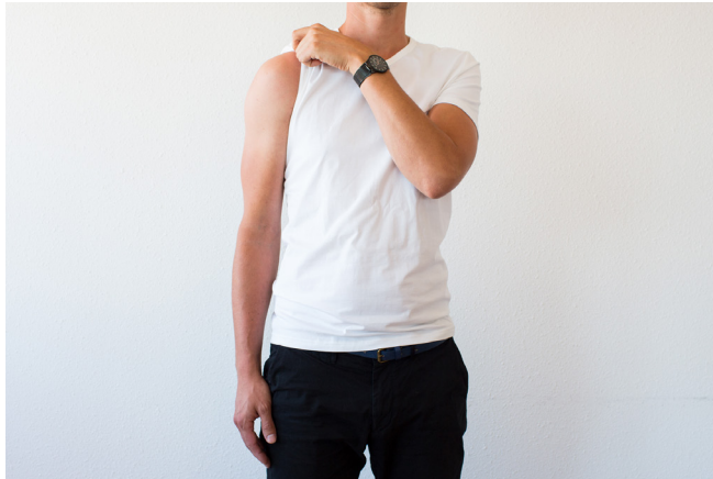
B. Make sure the affected arm is fully in view.