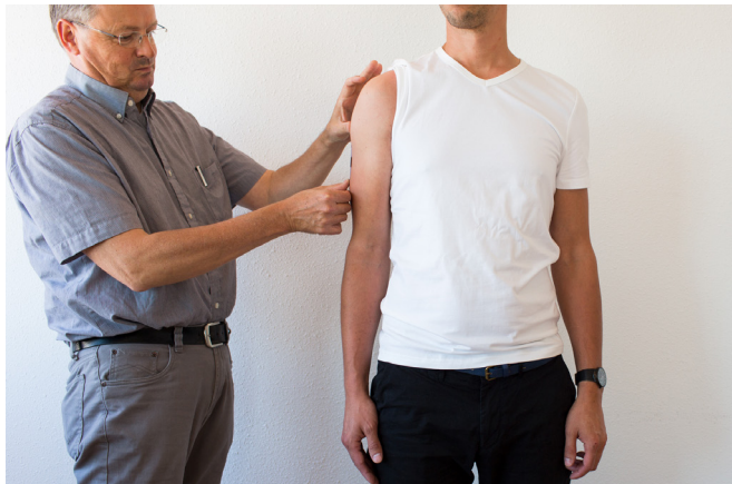
D. Stick the measurement label sagittal on the upper arm.