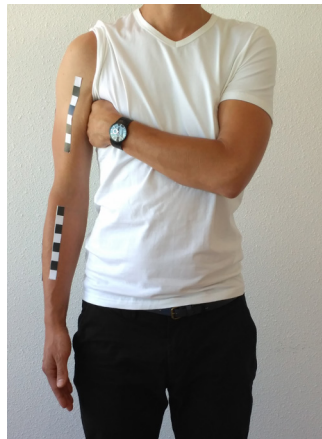
G. This is the frontal photo.