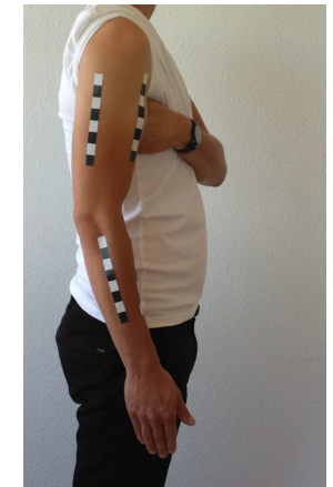
I. This is the sagittal photo.