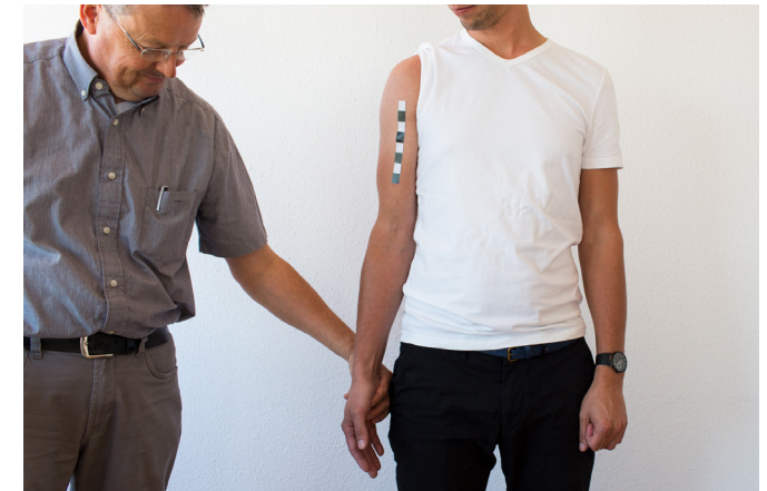
F. Now make sure the thumb is pointing forward.