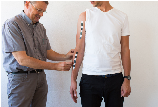
H. Stick the fourth measurement label sagittal on the forearm