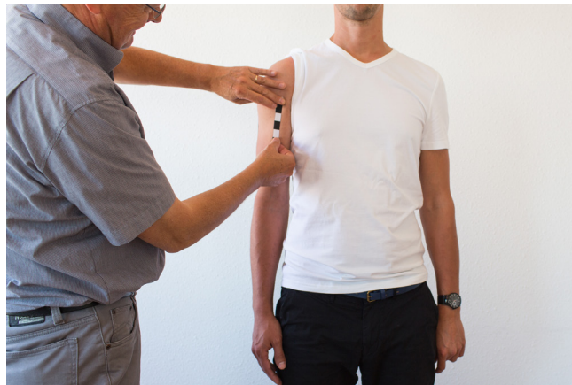
E. Stick the second measurement lable frontal on the upper arm.